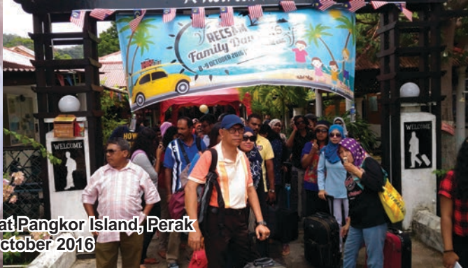
Annual Family Day at Pangkor Island, Perak 8 & 9 October 2016