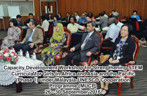
Capacity Development Workshop for Strengthening STEM Curricula for Girls in Africa and Asia and the Pacific (Phase 1) under Malaysia-UNESCO Cooperation Programme (MUCP) 26-30 September 2016