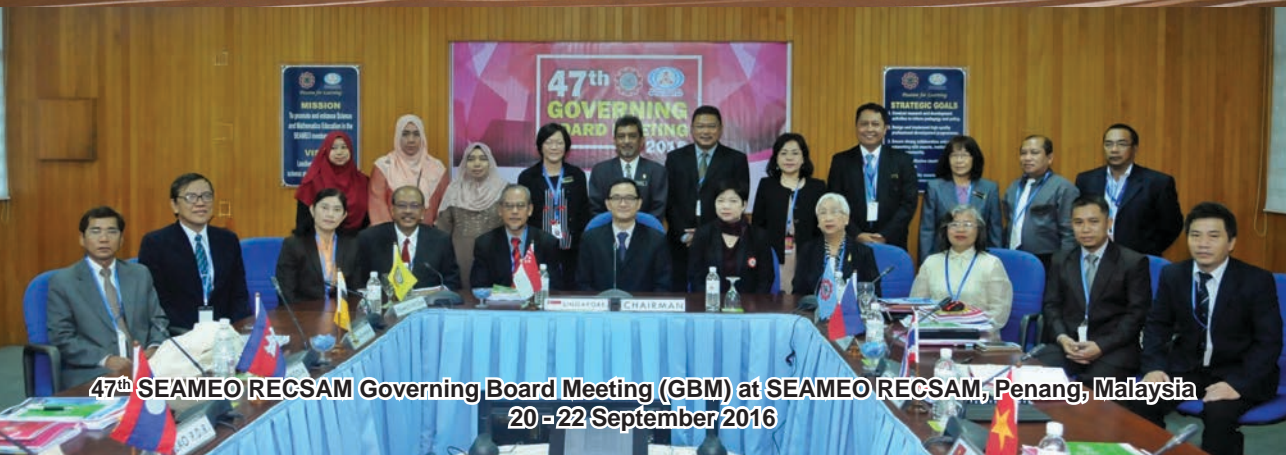
47 th SEAMEO RECSAM Governing Board Meeting (GBM) at SEAMEO RECSAM, Penang, Malaysia 20 -22 September 2016