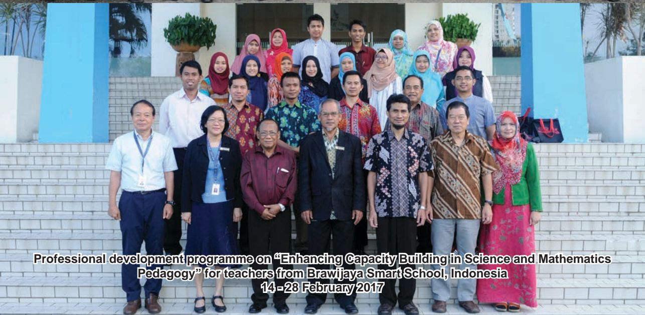
Professional development programme on “Enhancing Capacity Building in Science and Mathematics Pedagogy” for teachers from Brawijaya Smart School, Indonesia 14-28 February 2017