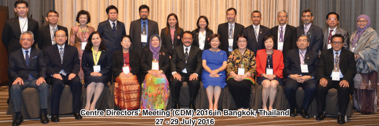
Centre Directors' Meeting (CDM) 2016 in Bangkok, Thailand 27 -29 July 2016