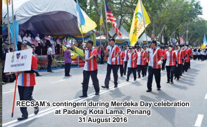
RECSAM's contingent during Merdeka Day celebration at Padang Kota Lama, Penang 31 August 2016