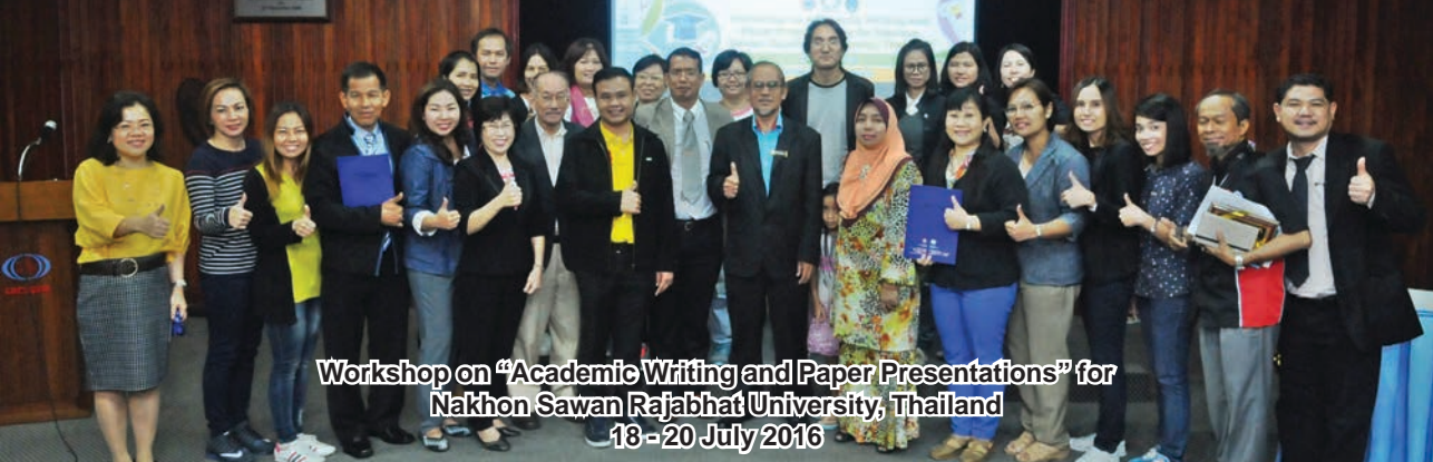
Workshop on "Academic Writing and Paper Presentations" for Nakhon Sawan Rajabhat University, Thailand 18 - 20 July 2016