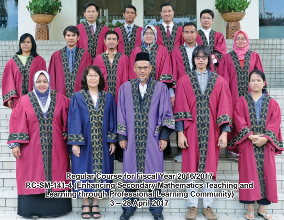
Regular Course for Fiscal Year 2016/2017 RC-SM-141-4 (Enhancing Secondary Mathematics Teaching and Learning through Professional Learning Community) 3 - 28 April 2017

3 - 28 APRIL 2017 SEAMEO RECSAM, PENANG, MALAYSIA