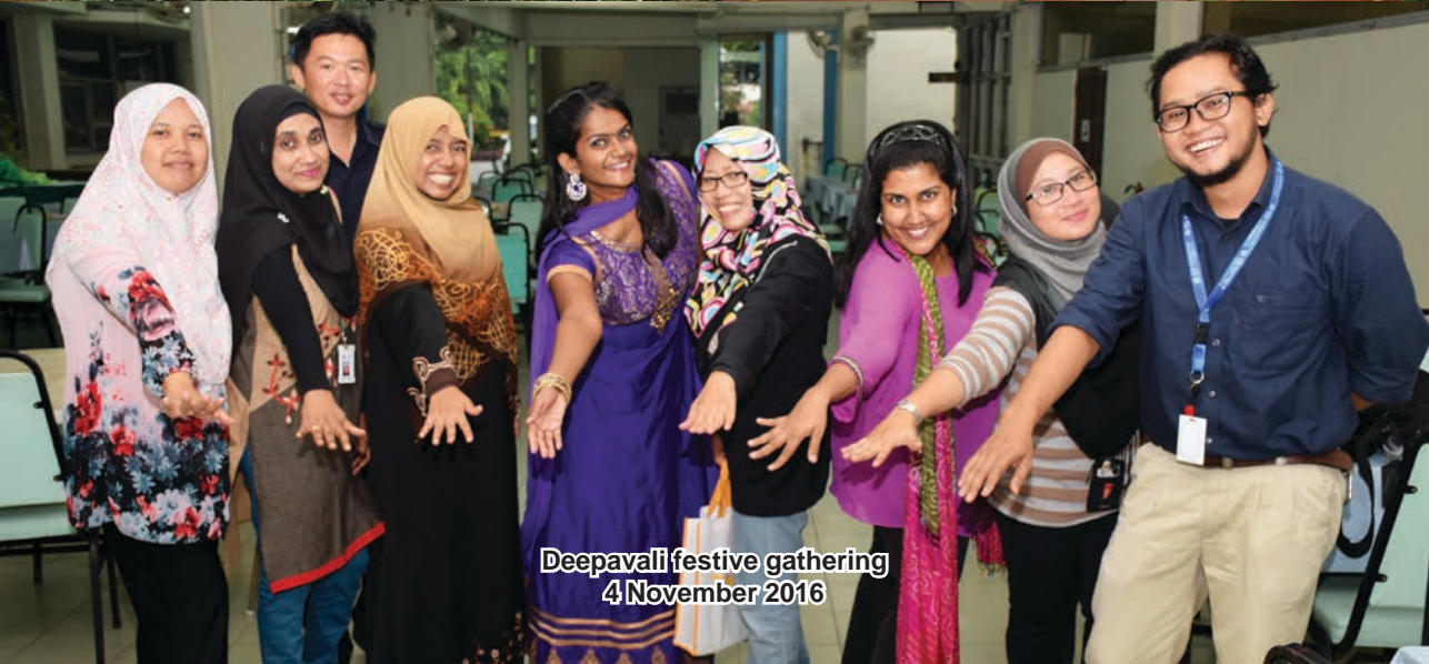
Deepavali festive gathering 4 November 2016