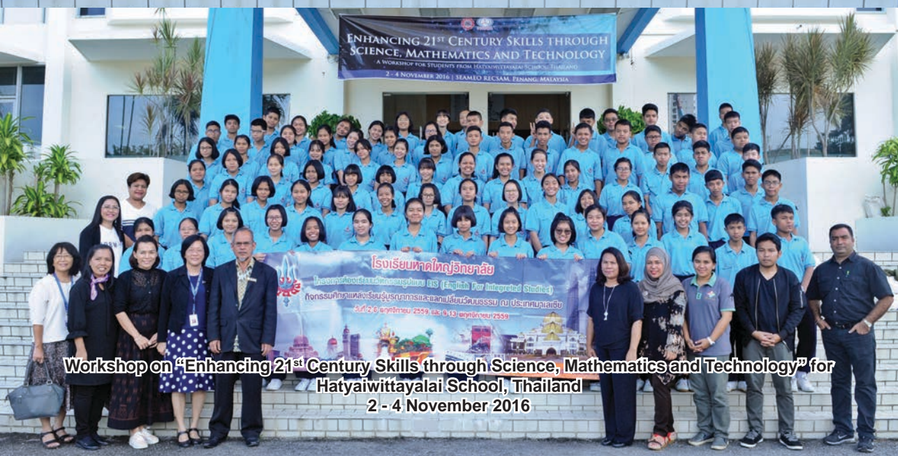
Workshop on "Enhancing 21 st Century Skills through Science, Mathematics and Technology" for Hatyaiwittayalai School, Thailand 2 - 4 November 2016