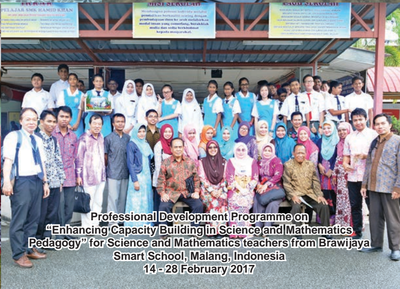
Professional Development Programme on "Enhancing Capacity Building in Science and Mathematics Pedagogy" for Science and Mathematics teachers from Brawijaya Smart School, Malang, Indonesia 14 - 28 February 2017