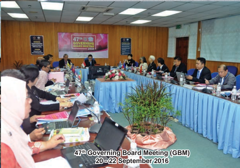
47th Governing Board Meeting (GBM) 20-22 September 2016