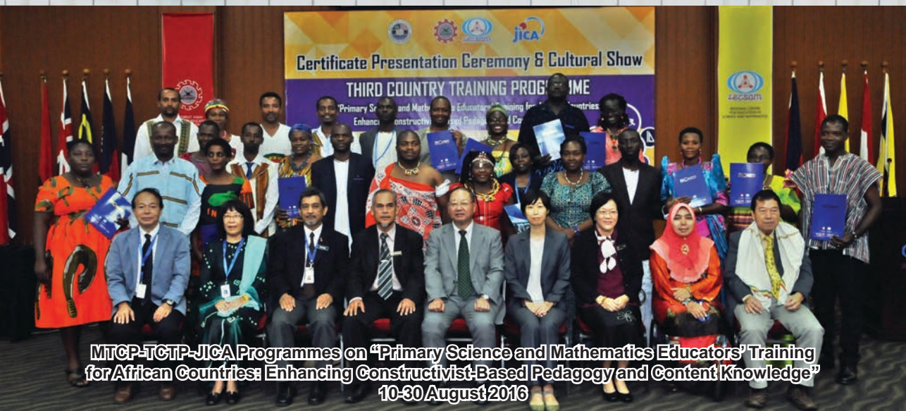
MTCP-TCTP-JICA Programmes on "Primary Science and Mathematics Educators' Training for African Countries: Enhancing Constructivist-Based Pedagogy and Content Knowledge" 10-30 August 2016