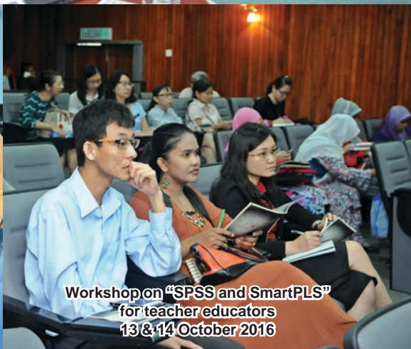
Workshop on "SPSS and SmartPLS" for teacher educators 13 & 14 October 2016