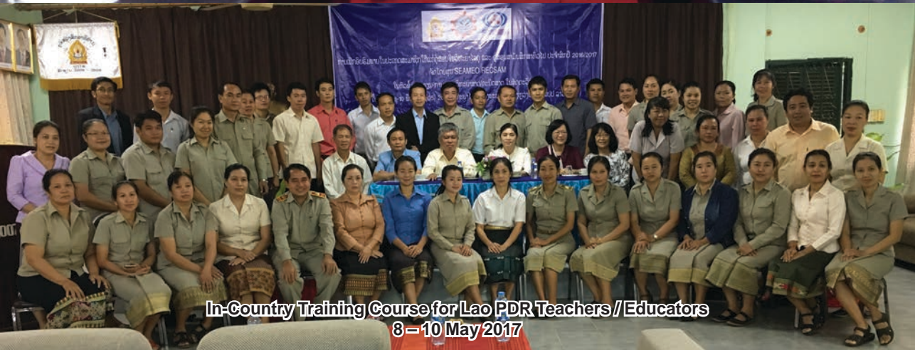
In-Country Training Course for Lao PDR Teachers // Educators 8–10 May 2017