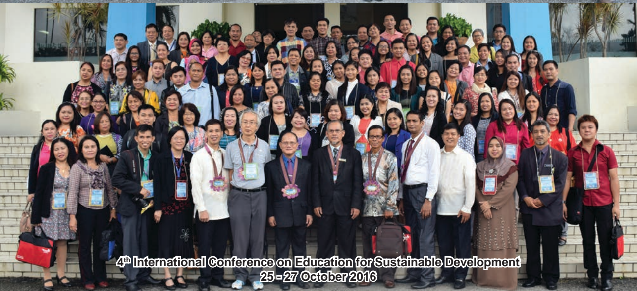
4 th International Conference on Education for Sustainable Development 25-27 October 2016