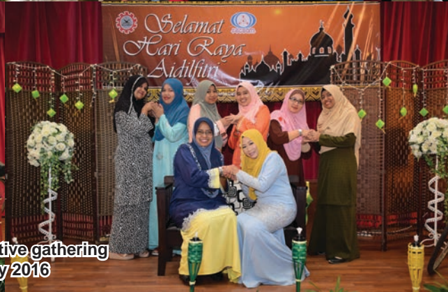
Hari Raya festive gathering 22 July 2016