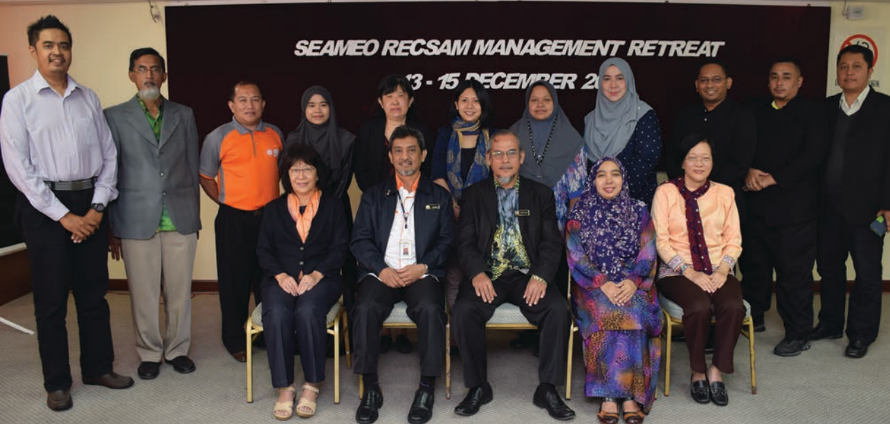
Management Retreat in Cameron Highlands, Pahang, Malaysia 13 - 15 December 2016