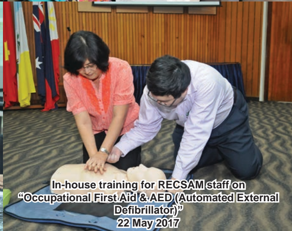
In-house training for RECSAM staff on "Occupational First Aid & AED (Automated External Defibrillator)" 22 May 2017