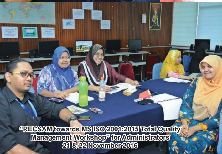
"RECSAM towards MS ISO 2001:2015 Total Quality Management Workshop" for Administrators 21 & 22 November 2016