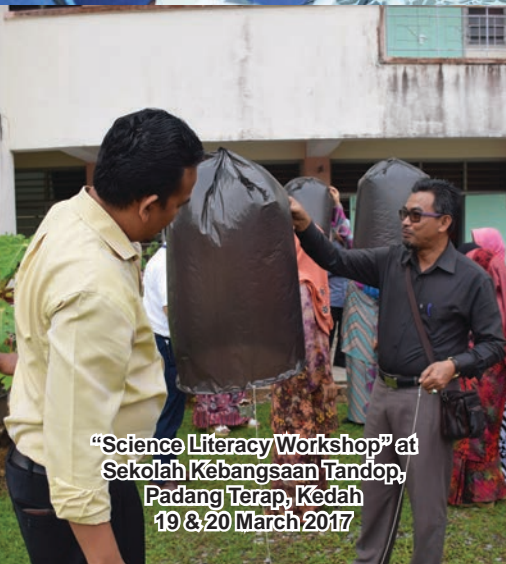
"Science Literacy Workshop" at Sekolah Kebangsaan Tandop, Padang Terap, Kedah 19 & 20 March 2017