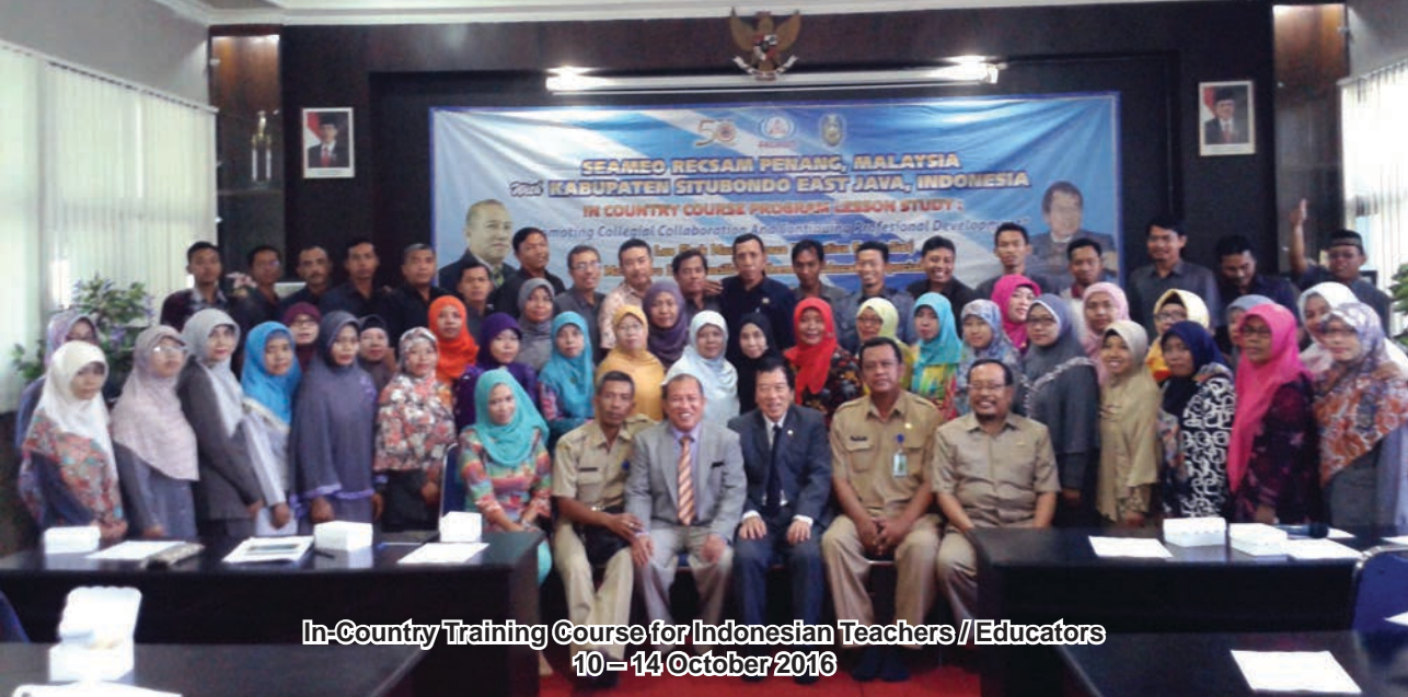
In-Country Training Course for Indonesian Teachers // Educators 10–14 October 2016