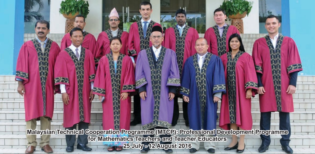
Malaysian Technical Cooperation Programme (MTCP): Professional Development Programme for Mathematics Teachers and Teacher Educators 25 July - 12 August 2016