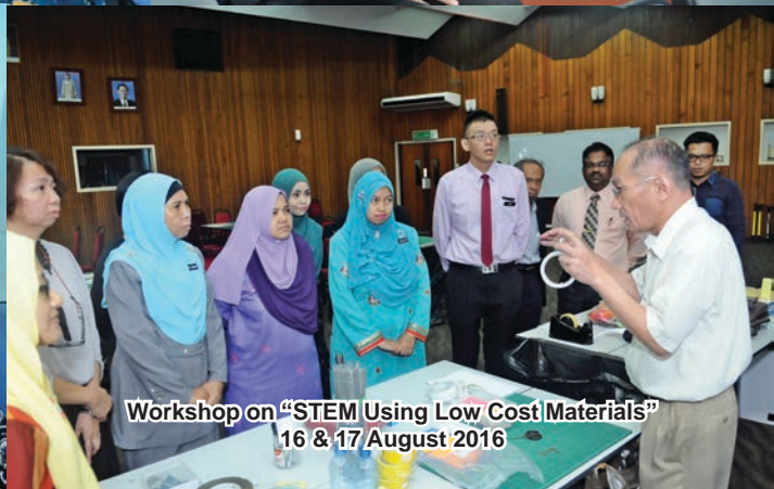
Workshop on "STEM Using Low Cost Materials" 16 & 17 August 2016