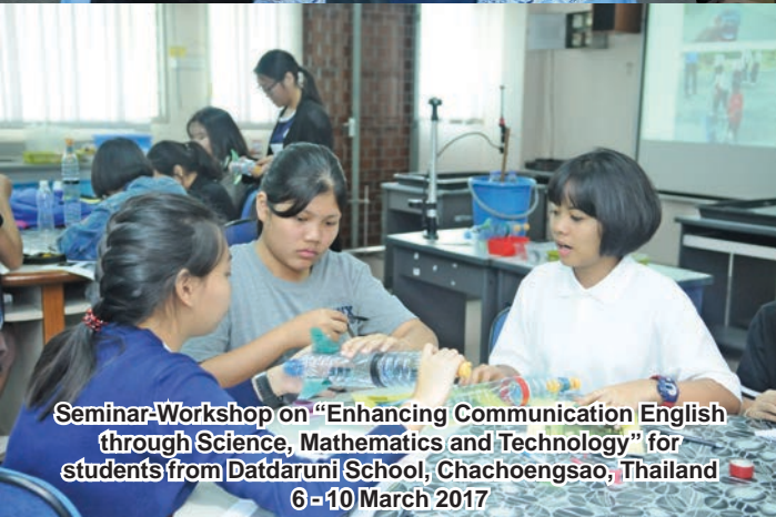
Seminar-Workshop on "Enhancing Communication English through Science, Mathematics and Technology" for students from Datdaruni School, Chachoengsao, Thailand 6 -10 March 2017