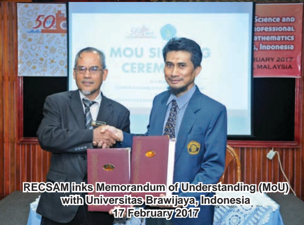
RECSAM inks Memorandum of Understanding (MoU) with Universitas Brawijaya, Indonesia 17 February 2017