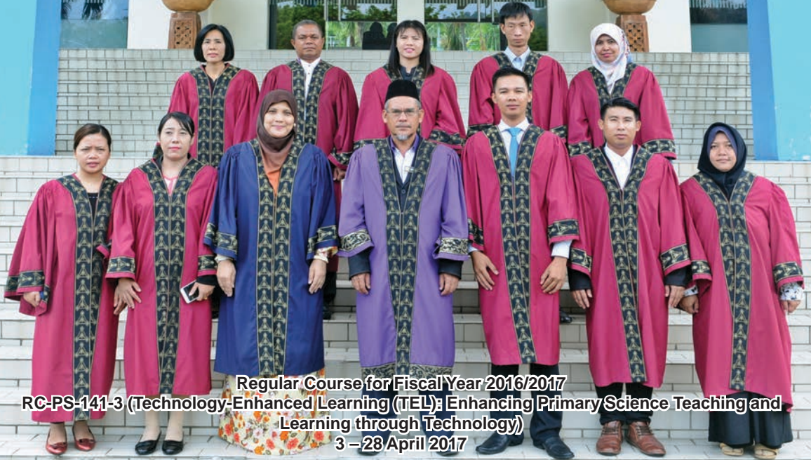
Regular Course for Fiscal Year 2016/2017 RC-PS-141-3 (Technology-Enhanced Learning (TEL): Enhancing Primary Science Teaching and Learning through Technology) 3 - 28 April 2017

3 - 28 APRIL 2017 SEAMEO RECSAM, PENANG, MALAYSIA