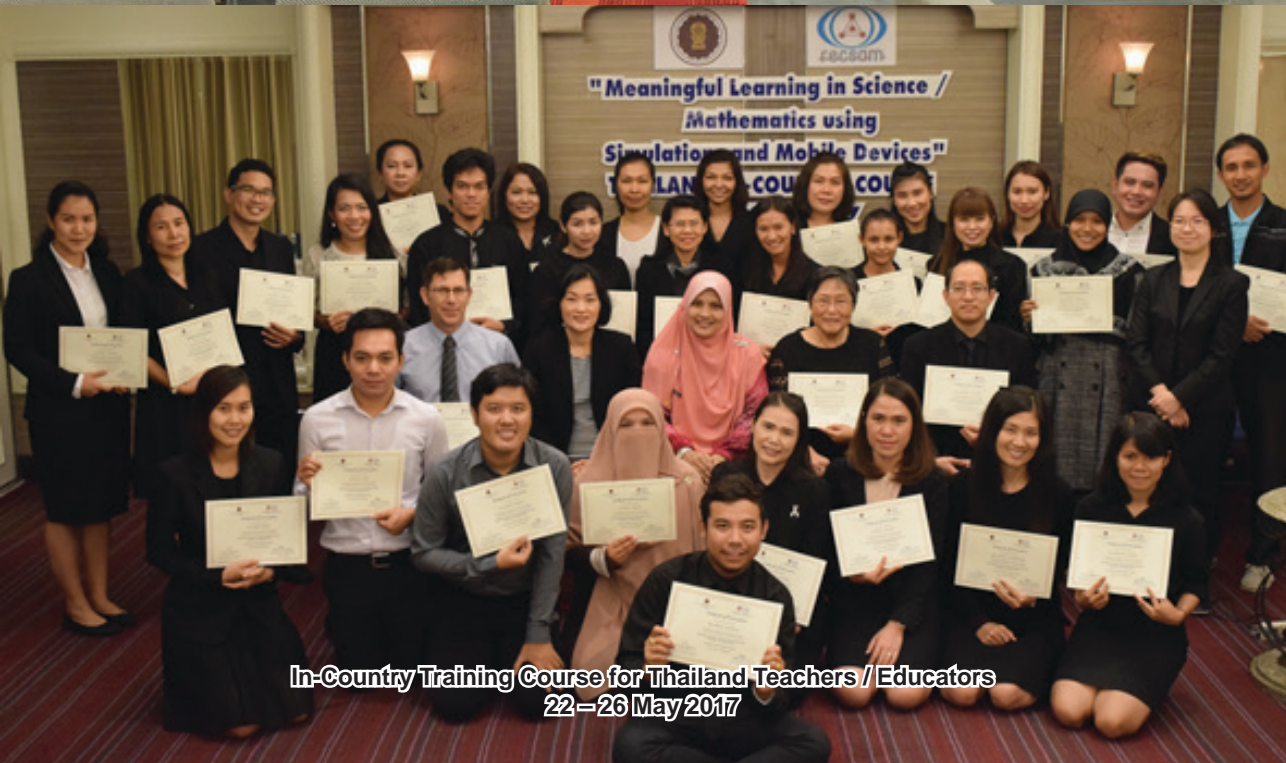
In-Country Training Course for Thailand Teachers // Educators 22–26 May 2017