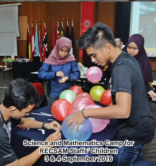
Science and Mathematics Camp for RECSAM Staffs' Children 3 & 4 September 2016