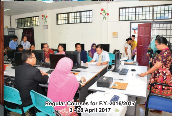
Regular Courses for F.Y. 2016/2017 3 -28 April 2017