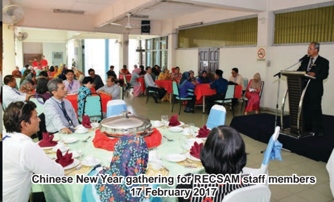
Chinese New Year gathering for RECSAM staff members 17 February 2017