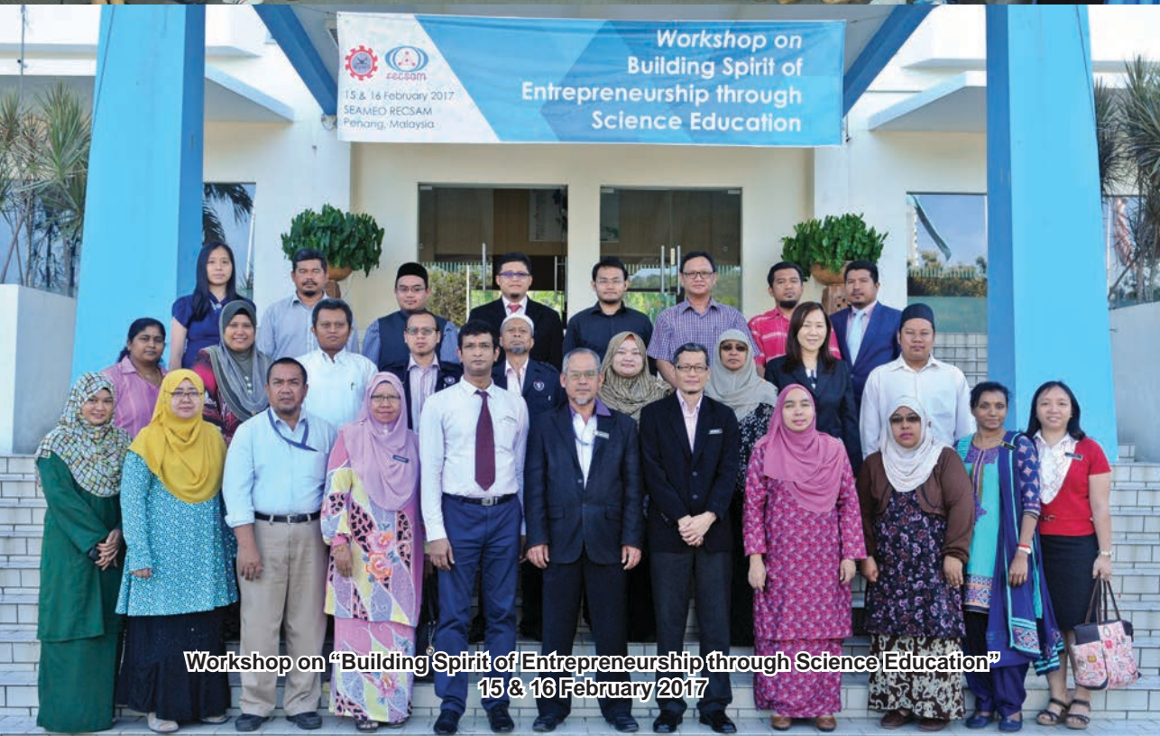
Workshop on "Building Spirit of Entrepreneurship through Science Education" 15 & 16 February 2017