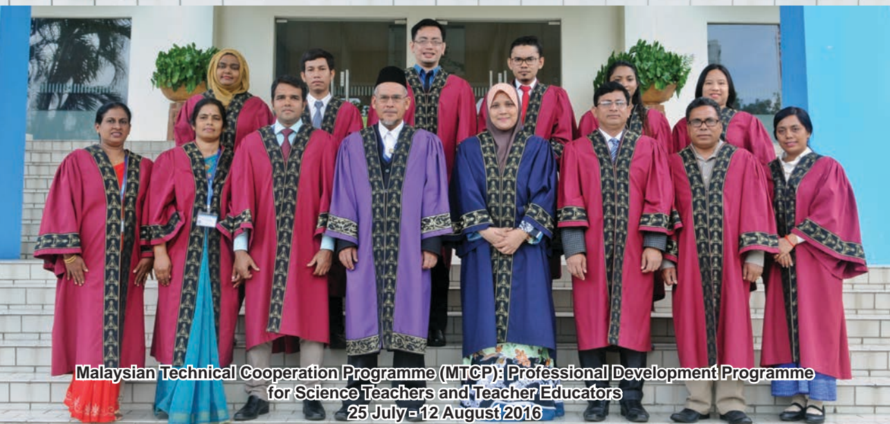
Malaysian Technical Cooperation Programme (MTCP): Professional Development Programme for Science Teachers and Teacher Educators 25 July - 12 August 2016